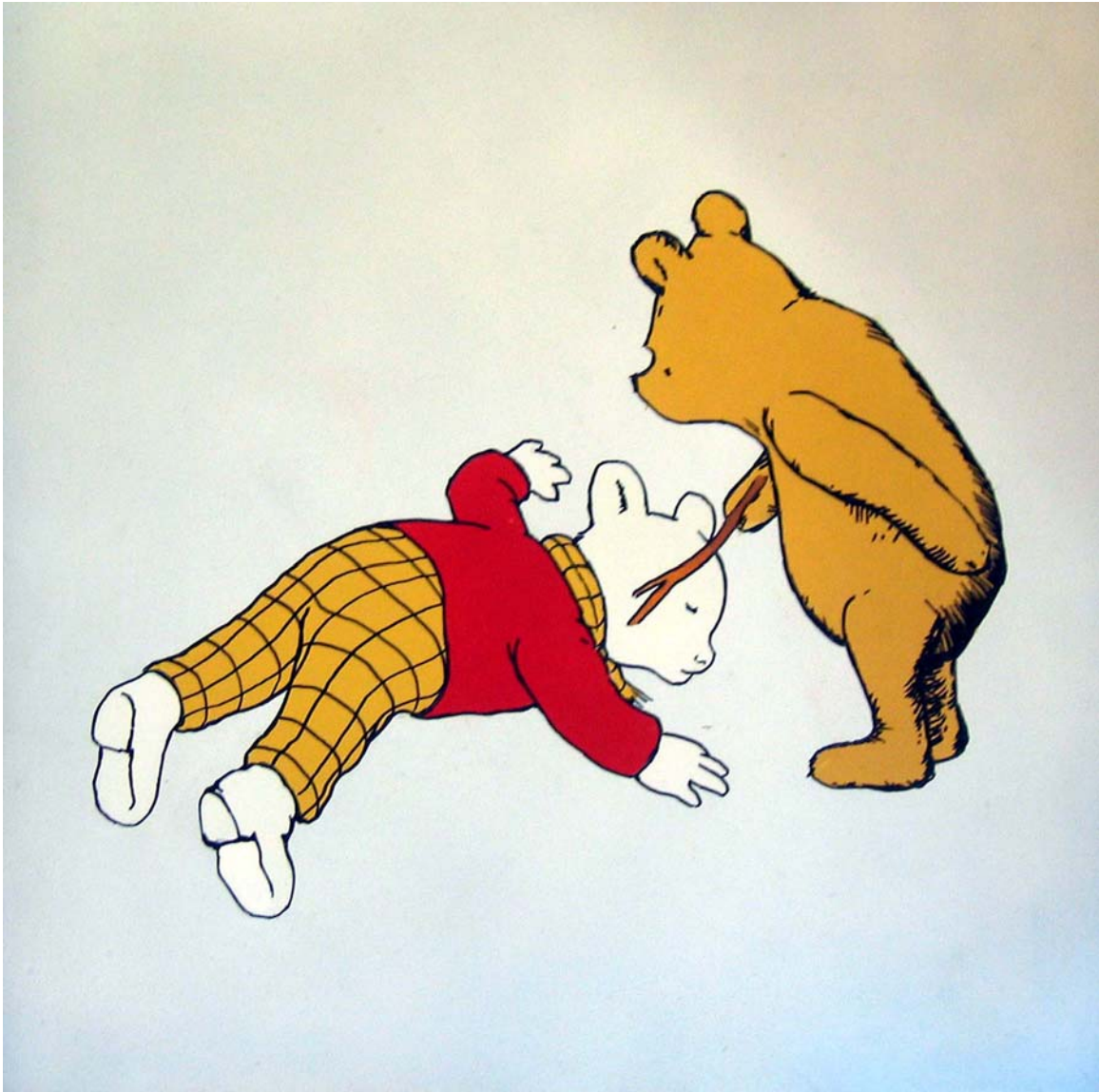
Winnie the Pooh is Innocent enamel on aluminium 50 x 50 cm (2006)