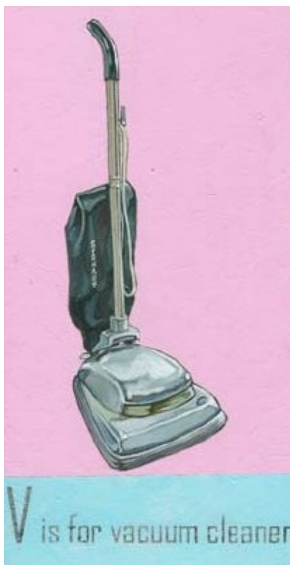
V is for Vacuum Cleaner oil on board 21 x 30 cm (2006)